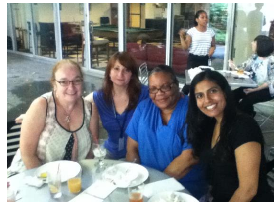
Staff enjoying annual BBQ

Dates & Time: Tuesday and Thursday sessions from 8:00-9:00am between July 16th and August 15th .